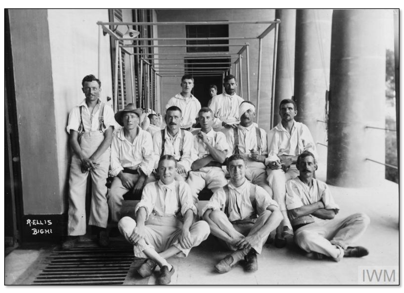
Wounded Australian and British soldiers outside one of the small wards at Bighi Hospital, Malta.